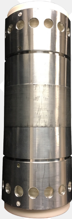
HUMIDIPOWER FUEL CELL HUMIDIFIER

Interested in a custom solution? Contact us at EFCustomerService@pentair.com